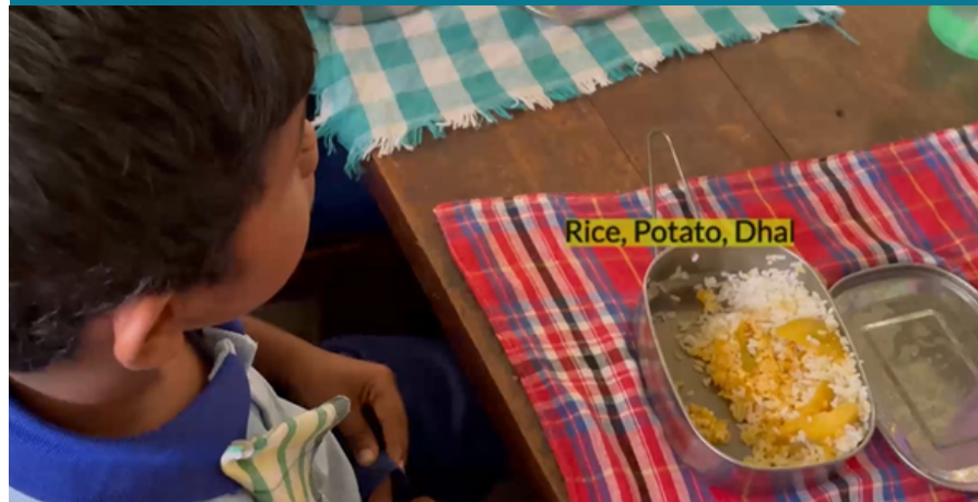
Rice, Potato, Dhal

Even as Sri Lanka recovers from the 2022 economic crisis , with 5% growth in 2024 and 3.5% projected for 2025, many families in rural and plantation areas continue to struggle with high inflation and daily hardships.