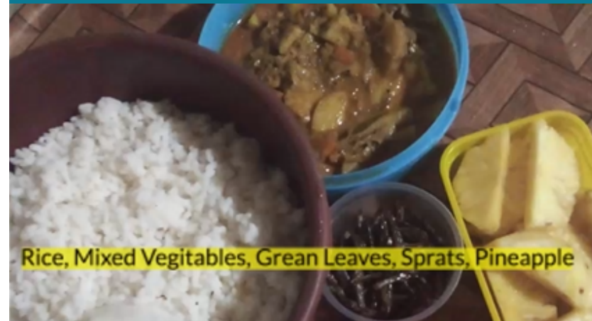
Rice, Mixed Vegetables, Green Leaves, Sprats, Pineapple