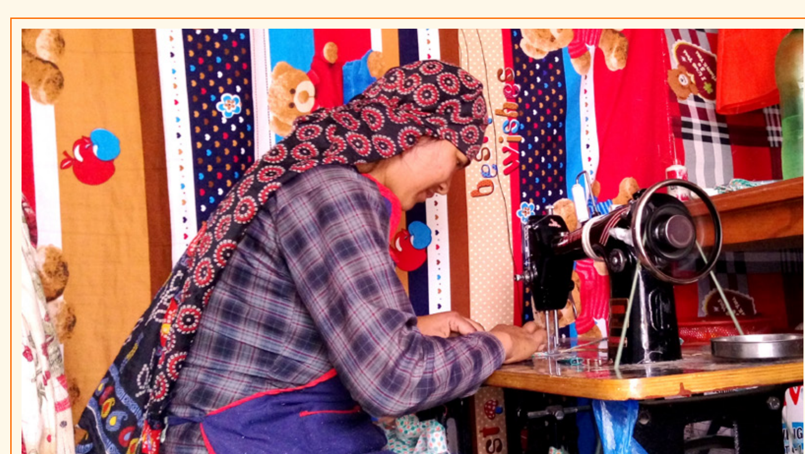
Trainees enjoy sewing and starting their own businesses.