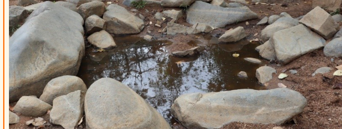
The unprotected well used by the community as a source of water after the cyclone.

After Cyclone Idai struck in March 2019, a village in Zimbabwe lost its nearest safe water source. Beulah, a villager, shares, "We had to travel more than 7km to the nearest clean water source where we would have to join a long queue just for fetching one 20L bucket of water per person. 20L of water was not sufficient for our family's daily use, so we had to use the water from the open well but that was unsafe and clean. We knew that the water from the open well was unsafe, but that was the only available water source we had."