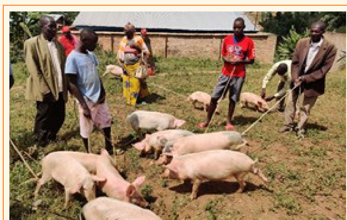
Beneficiaries of pigs were so excited about the gifts.

Due to COVID-19 and nationwide lockdown, vocational skills training for out-of-school adolescents was suspended in 2020.