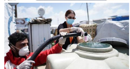
World Vision providing water for refugees