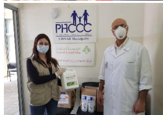
World Vision Lebanon is helping to protect community members, health workers and refugees by providing them with hygiene kits, sanitizers and more.